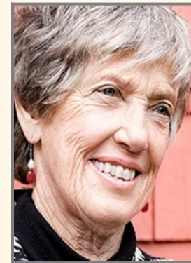
Joanna Macy, founding teacher of The Work That Reconnects

To the contrary, Joanna Macy declares, with the deep strength of a grandmother determined to protect her family and the Family of Life as well, our pain for the world bears witness to our love for the world. Our pain for the world is not a failure, it is the best part of us yearning to be expressed. Even more, our pain for the Web of Life and the obliteration of countless species, is the Web of Life itself speaking through us , moving through us, and calling us to a life of heroic service.