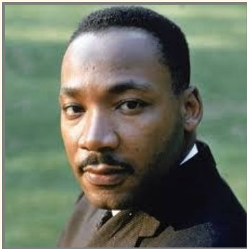
Rev. Dr. Martin Luther King, Jr.

You have the power, in both of these visions, the spiritual and the spirit-in-nature, to begin the change you want to see. And you have the power to stand against the entire world in those times when the world sinks into the confusion of greed and violence. In terms of a mutual support network, Gandhi's vision allows us to see one another as partners in the mobilization of that profound compassionate intelligence, hidden, but yearning to be born, in every human being. (Please see the Deep Green Awakening page on Mahatma Gandhi Study Resources )